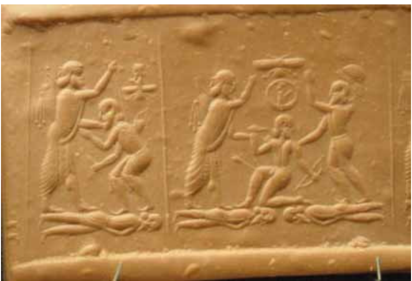
Cylinder Seal depicting War in Heaven

I?n? ?t?h?e? ?H?e?b?r?e?w? ?B?i?b?l?e? ?a?n?d? ?s?e?v?e?r?a?l? ?n?o?n?-?c?a?n?o?n?i?c?a?l? ?J?e?w?i?s?h? ?a?n?d? ?e?a?r?l?y? ?C?h?r?i?s?t?i?a?n? ?w?r?i?t?i?n?g?s?,? ?n?e?p?h?i?l?i?m? m?e?a?n?s? ?t?h?e? ?f?a?l?l?e?n? ?[?o?n?e?s?]? ?a?r?e? ?a? ?p?e?o?p?l?e? ?c?r?e?a?t?e?d? ?b?y? ?t?h?e? ?c?r?o?s?s?-?b?r?e?e?d?i?n?g? ?o?f? ?t?h?e? ?"?s?o?n?s? ?o?f? ?G?o?d?"? a?n?d? ?t?h?e? ?"?d?a?u?g?h?t?e?r?s? ?o?f? ?m?e?n?"?.? T?h?e? ?w?o?r?d? ?n?e?p?h?i?l?i?m? ?i?s? ?l?o?o?s?e?l?y? ?t?r?a?n?s?l?a?t?e?d? ?a?s? ?g?i?a?n?t?s? ?o?r? ?t?i?t?a?n?s? ?i?n? ?s?o?m?e? ?B?i?b?l?e?s?,? ?a?n?d? ?i?s? ?l?e?f?t? ?u?n?t?r?a?n?s?l?a?t?e?d? ?i?n? ?o?t?h?e?r?s?.